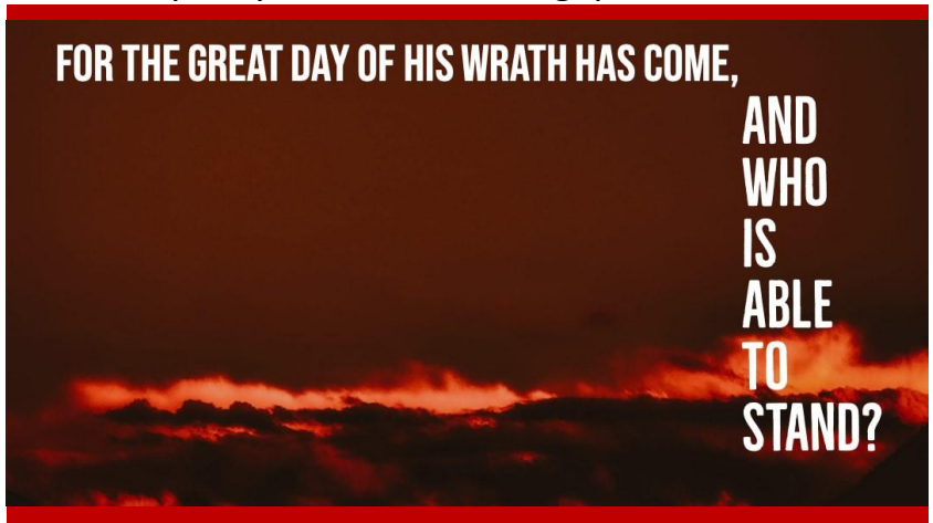
This is why they ask that haunting question:

This question is so important, so significant.... that the revealing to John of the breaking of the 7<sup>th</sup> seal is delayed until it is answered. And it is here we will stop for today.