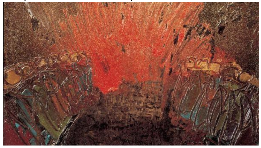
... "like the blowing of a violent wind."

On that day, the day of Pentecost, a large crowd rushed to the place where the disciples were because they had heard the sound..