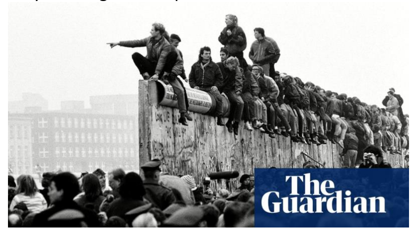
https://warwick.ac.uk/newsandevents/knowledgecentre/arts/modern-languages/berlin_wall A newspaper in England wrote: On 9 November 1989, the exuberance of Berliners spread like wildfire around the globe.