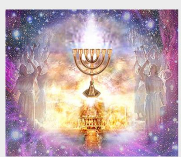
The Holy Spirit

Jesus as the lion of Judah and the lamb looking as if it had been slain.