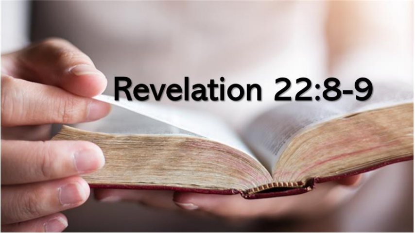
The reading of God's word. Prayer